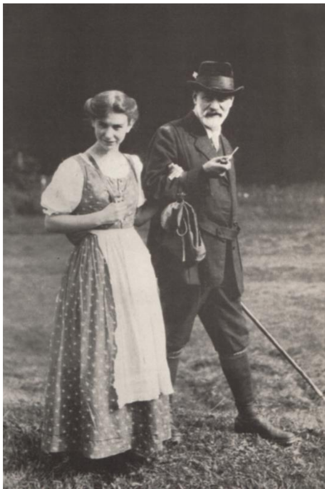
Anna and Sigmund Freud (1913)