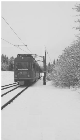
The Ritten/Renon train